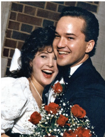
Wedding day, December 19, 1989.