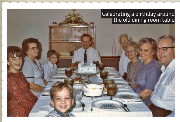
Celebrating a birthday around the old dining room table