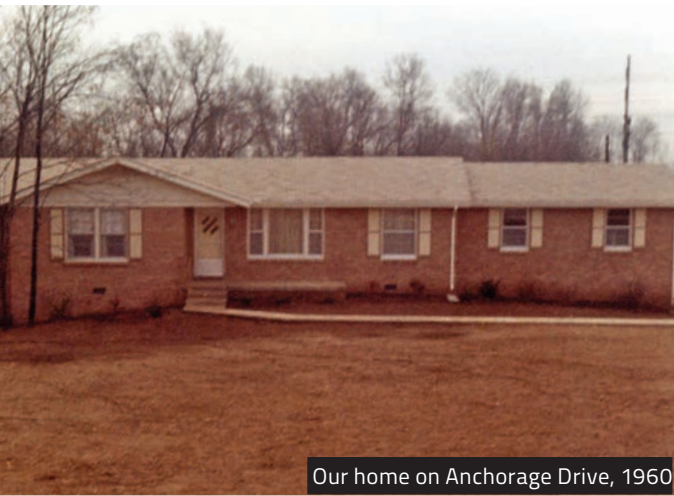
Our home on Anchorage Drive, 1960